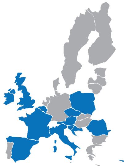
Figure 3. Explicit references to forms of gender-based violence in sport in policies of EU Member States

Various policy documents from across different sectors make explicit reference to forms of gender-based violence within sport. These are described below. They include national strategies, programmes, action plans, or codes of ethics within the policy areas of sport, gender equality, and child protection. There are also numerous examples of initiatives that have been established to raise awareness of gender-based violence in and through sport. Other relevant initiatives to combat gender-based violence in sport were developed by sport and civil society organisations. These are discussed in Chapter 6.